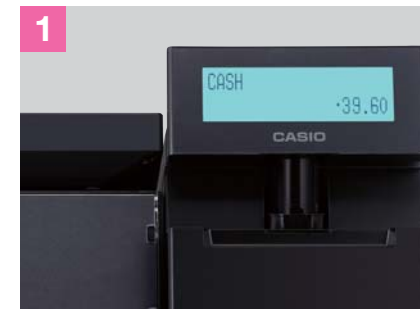
Built-in rear customer display.