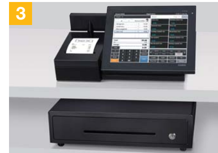
The optional drawer can be set separately from the terminal which will enable flexible layout.