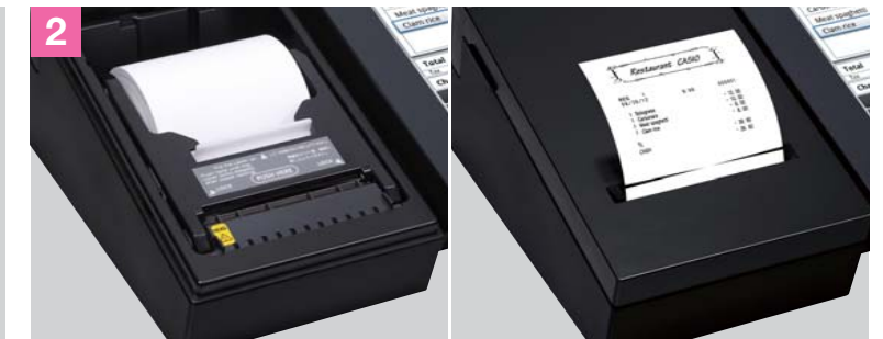
Built-in thermal printer which is able to use 50mm and 80mm roll paper.