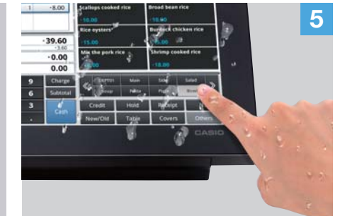
Touch panel screen conforms to the IPX2 drip-resistance which can be operated even with wet hand.