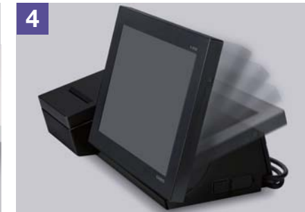
Easy to use and stylish touch panel equipped with motor-driven tilt mechanism.